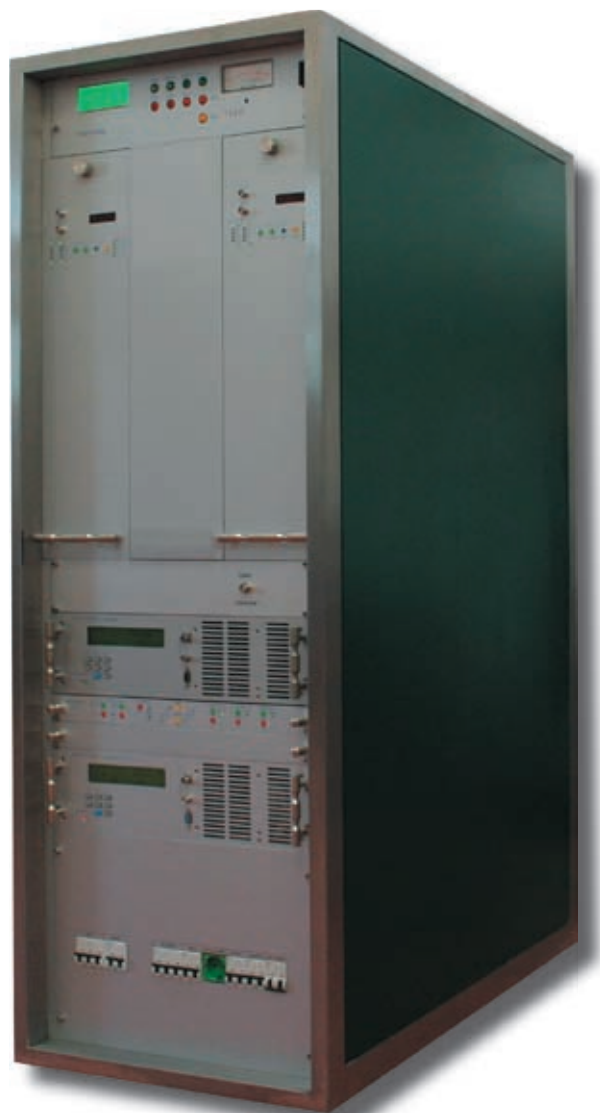
3A5K0A - 5KW VHF Solid State Transmitter

Three step-down transformers, used to provide a total redundancy and protection, are mounted on slide-out wheels in order to get ease installation and maintenance operations.