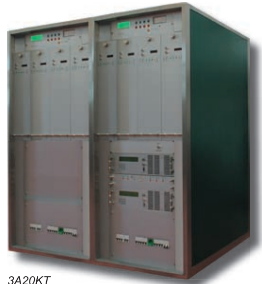
3A20KT Functional Block Diagram