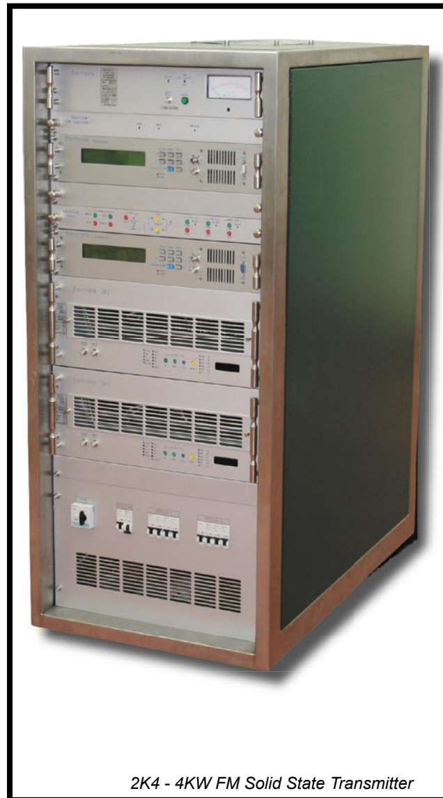
2K4 - 4KW FM Solid State Transmitter

Three step-down transformers, used to provide a total redundancy and protection, are mounted on slide-out wheels in order to get ease installation and maintenance operations.